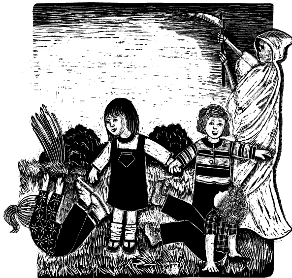
We All Fall Down