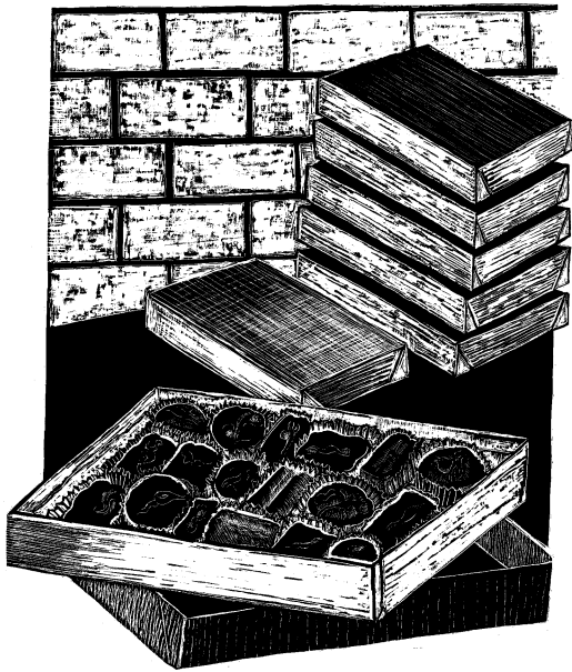
The Chocolate War