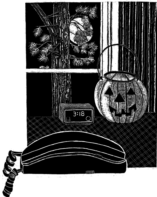
In the Middle of the Night